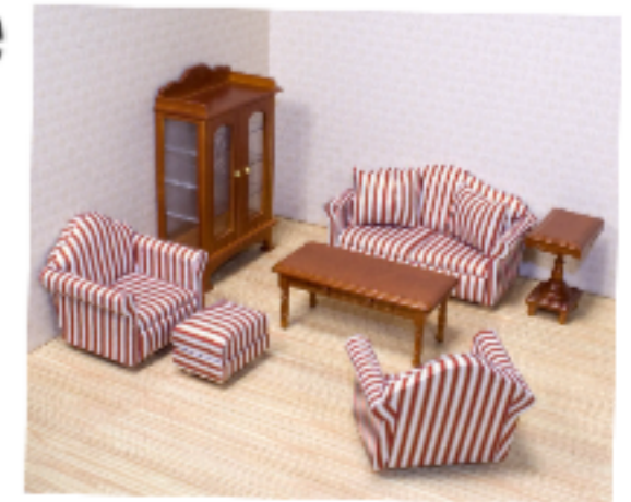
Doll house furniture