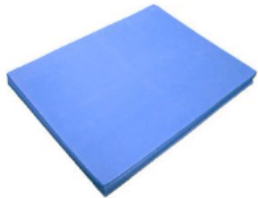
Blue fun foam