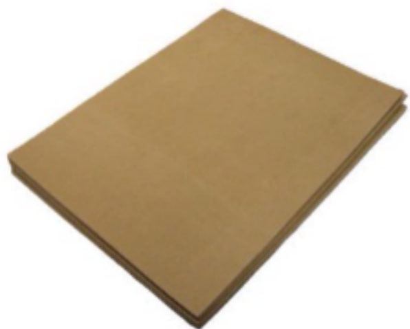
Brown fun foam