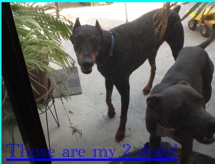
Those are my 2 dogs!